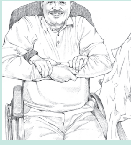
First clinician stands behind the patient.