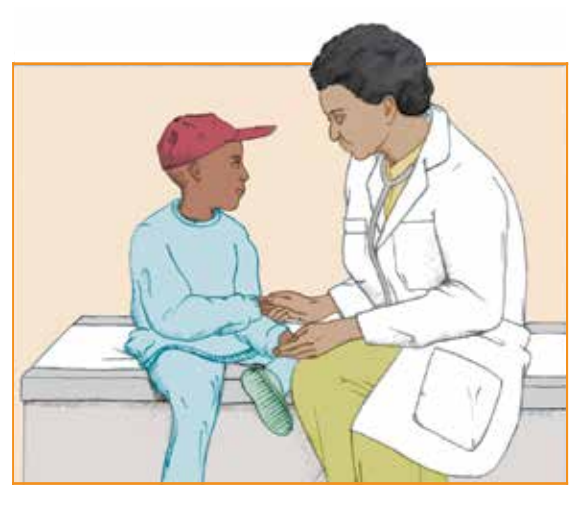
Your child has special dental needs.

Before chemotherapy begins, take your child to a dentist. The dentist will check your child's mouth carefully and pull loose teeth or those that may become loose during treatment. Ask the dentist or hygienist what you can do to help your child with mouth care.