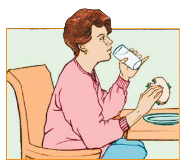
Sipping liquids with your meals will make eating easier.