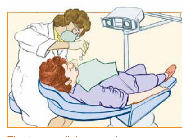
The dentist will do a complete exam.