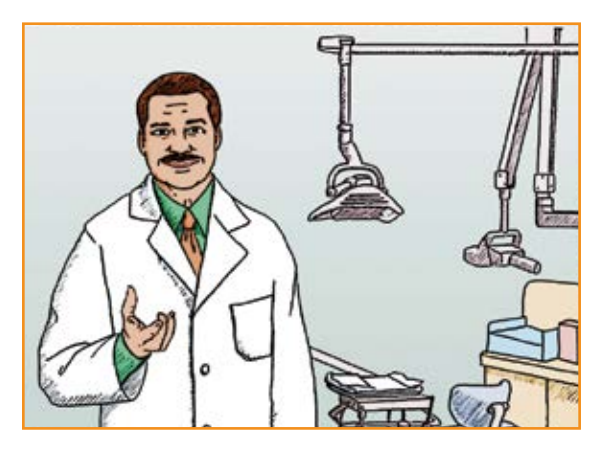
A dentist can help prevent mouth problems.

To help prevent serious problems, see a dentist ideally I month before starting chemotherapy.