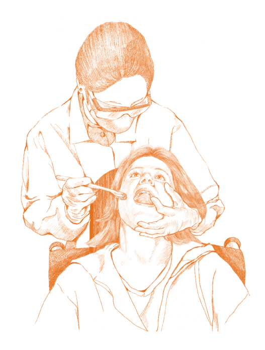
Positioning for treating a patient in a wheelchair. Note the support a sliding board can provide. Sliding or transfer boards are available from home health care companies.

UNCONTROLLED BODY MOVEMENTS can jeopardize safety and your ability to deliver dental care. Pay special attention to the following: