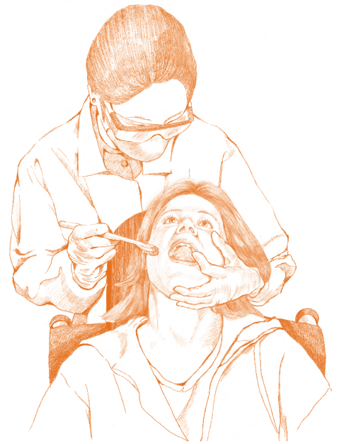
Positioning for treating a patient in a wheelchair. Note the support a sliding board can provide. Sliding or transfer boards are available from home health care companies.

UNCONTROLLED BODY MOVEMENTS can jeopardize safety and your ability to deliver dental care. Pay special attention to the following: